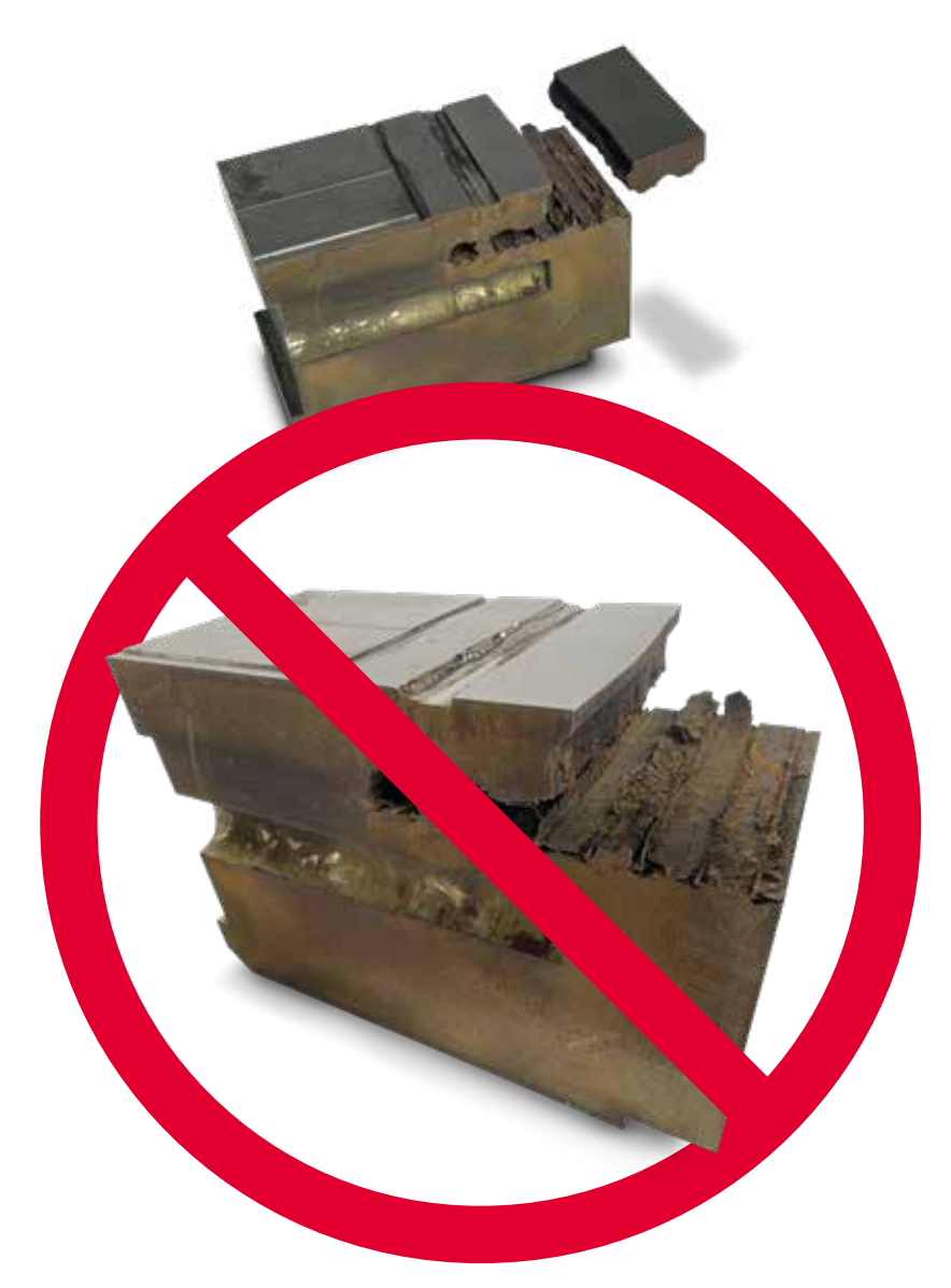
Here you can see severe corrosion damage that led to the breakage of the tool insert.